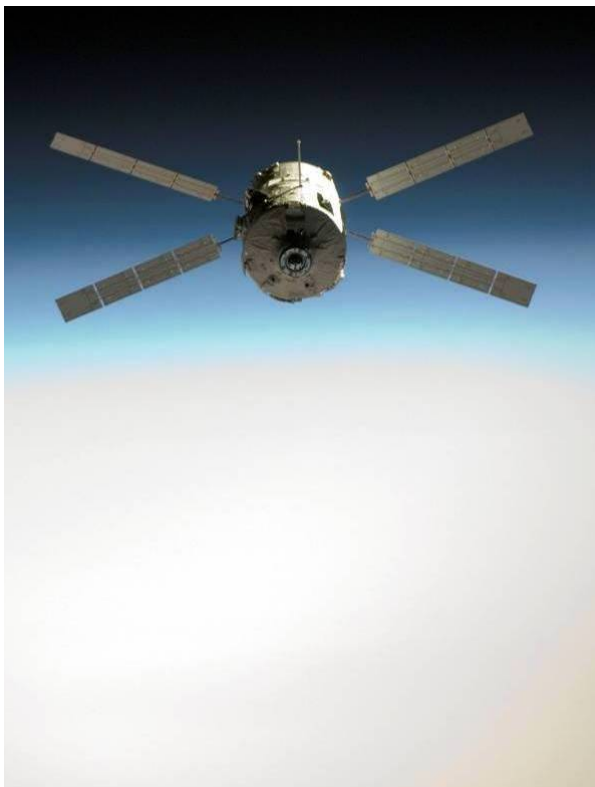
The European ATV is one of the vital logistics spacecraft, which will help support a six-person crew. Shown above is 'Jules Verne' the first ATV on 31 March 2008 during rendezvous and docking test manoeuvres with the ISS.

Until recently the ISS was only able to permanently support a permanent crew of three. However with the Station nearing completion and the delivery of new Environmental Control and Life Support Systems, together with support from logistics spacecraft, a six-member crew has now been made possible. These logistics spacecraft include the European Automated Transfer Vehicle (ATV), the Russian Progress spacecraft, the Japanese H-II Transfer Vehicle (due for its first launch during the OasISS Mission) and the Space Shuttle.