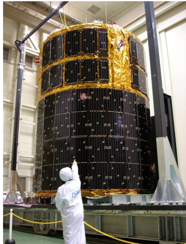
Pressurized and Unpressurized Carrier Assembly of the Japanese HTV.

First docking of the Japanese HTV - Robotic Arm Operations: Frank De Winne will be one of the two operators of the Station's robotic arm when it is used for docking the first Japanese H-II Transfer Vehicle (HTV-1), the Japanese logistics