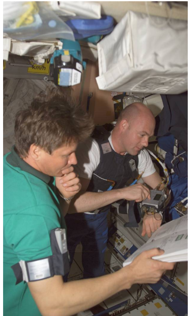
ESA astronaut André Kuipers (right) carrying out experiment procedures on the ISS as part of the European DELTA mission on 22 April 2004 with the assistance of ISS Expedition 9 Commander Gennady Padalka.

De Winne. As such Kuipers is similarly prepared to carry out the mission. Kuipers previously flew to the ISS on the Delta mission in April 2004 on the Russian Soyuz TMA-4 spacecraft and spent 12 days in space during the mission.