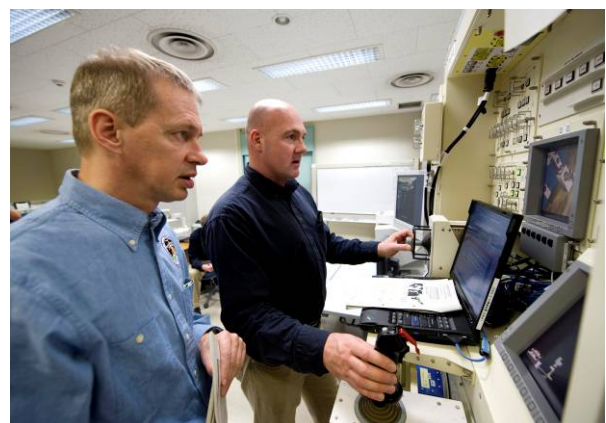
ESA astronauts Frank De Winne (left) and André Kuipers, (ESA's backup for the OasISS mission) during robotic arm training at the Tsukuba Space Center in Japan.

spacecraft to the ISS, in September 2009. He will also be the main operator of the Japanese robotic arm, which will be used to transfer scientific payloads to the Japanese external payload facility outside of the Japanese Kibo Laboratory.