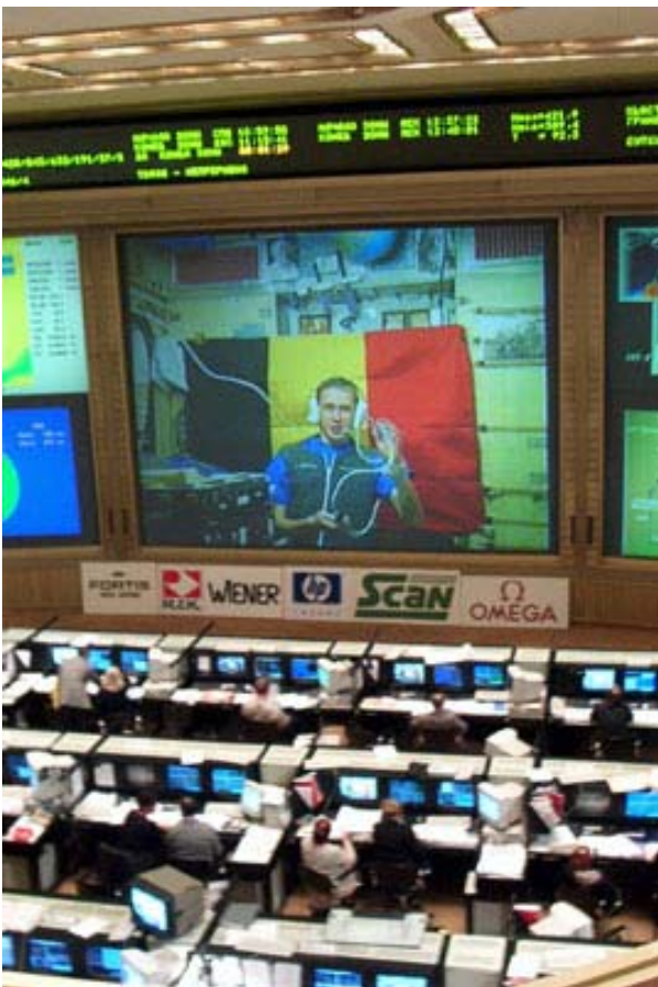
Frank De Winne on the large screen at the Mission Control Centre – Moscow during an in-flight call during the Odissea mission in November 2002.

the youth of today. Frank De Winne will be the prime focus of ESA's education activities during the mission. To this end he will be undertaking such activities as a live lesson from the ISS. As Frank is also a goodwill ambassador for UNICEF Belgium, this provides a great opportunity amongst other education activities during the mission for cooperation between ESA and UNICEF Belgium. This cooperation will be based on the common ground of water, and in support of UNICEF's water, sanitation and hygiene campaign (WASH). Water is not only one of the most important basic elements of life as we know it and therefore the most important thread to follow when searching for life in the universe but it is also a very important onboard resource for astronauts and spacecraft in orbit.