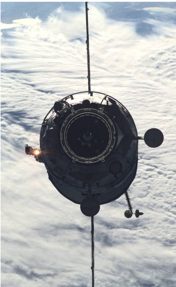
The Pirs Docking Compartment Approaches the International Space Station prior to docking on 16 September 2001.

Soyuz-U launcher, attached to a modified Progress spacecraft. Unlike the name suggests the Mini Research Module 2 is principally a docking compartment and airlock similar to the Russian Pirs Docking Compartment, which is currently attached to the Station's Russian Zvezda Service Module. The new docking compartment will be attached to the docking port on Zvezda on the opposite side of where Pirs is attached. This new module will obviously be advantageous in light of increased Russian Soyuz/Progress launches due to an increase to a six-member crew.