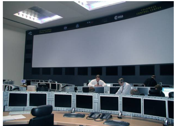
The Columbus Control Centre in Oberpfaffenhofen near Munich.

long-duration human spaceflight missions to the ISS. The control centre will be the hub of European activity during this mission, monitoring and coordinating the activities of De Winne, coordinating with the Mission Control Centres in Houston and Moscow, and coordinating with the European Astronaut Centre in Cologne and various User Support and Operations Centres throughout Europe. The mission will provide Europe with invaluable experience of long-term human spaceflight operations, which will be invaluable for planning future human exploration missions beyond low-Earth orbit.