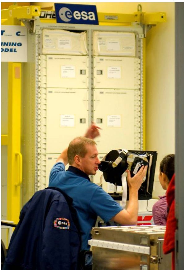
ESA astronaut Frank De Winne during experiment training at the European Astronaut Centre (EAC), in Cologne, Germany in October 2008.

Undertake an extensive European Experiment Programme: During the OasISS mission the European programme of scientific experiments and technology demonstrations will make use of the internal and external scientific facilities of the ISS and especially of the European Columbus laboratory, which was attached to the ISS in February 2008. Many of these experiments will be undertaken by ESA astronaut Frank De Winne,