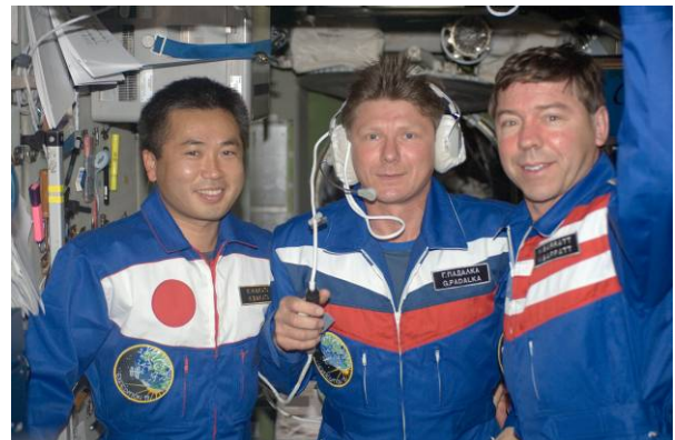
Current Expedition 19 crew on the ISS, who will become members of the six-person Expedition 20 Crew: ISS Commander Gennady Padalka (centre), and Flight Engineers Koichi Wakata (left) and Michael Barratt (right) on 4 April 2009.

The increase to a six-person crew will increase the time available for Frank De Winne and the rest of the crew to carry out important scientific and technological research in addition to their standard operational tasks. This is a visible sign of the increasing role that Europe is playing through ESA in human spaceflight and will provide a basis for future human exploration missions.