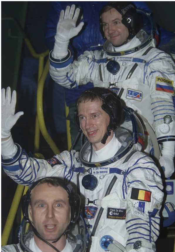
ESA astronaut Frank De Winne (centre) prior to launch aboard the Soyuz TMA-1 spacecraft in 2002 as part of the Odissea mission. The other Soyuz crew members pictured are Russian cosmonauts Yuri Lonchakov (top) and Sergei Zaletin (bottom).

For De Winne, who is a member of the European Astronaut Corps, this will be his second mission to the Station on behalf of ESA following on from the 12-day Odissea mission in 2002.