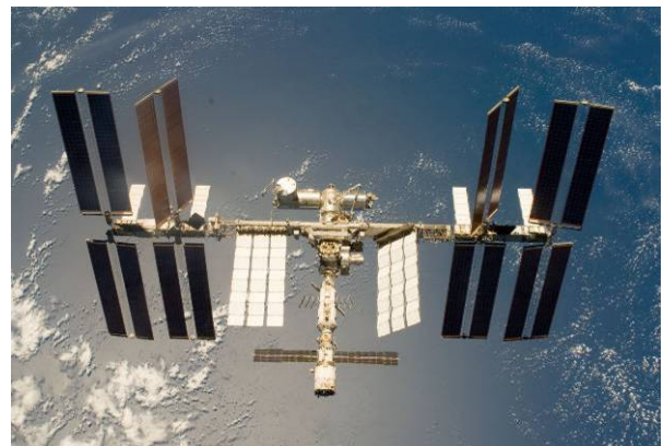
The International space Station in its current configuration as taken from Space Shuttle Discovery following undocking during the STS-119 mission on 25 March 2009.

Agreements: De Winne's flight is covered under the ISS agreement with its international programme partners by which ESA are entitled to an 8.3% share in the Station resources (crew time, power etc.) following the attachment of the Columbus laboratory to the ISS. This allows ESA to send one European astronaut to the ISS for a six-month mission every two years.