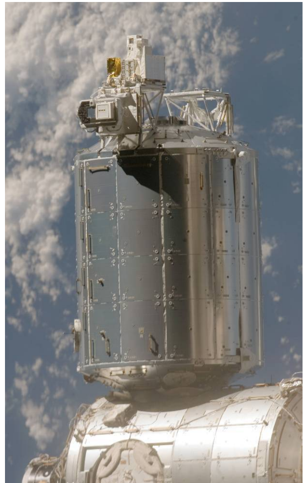
The European Columbus laboratory on 18 February 2008 attached to the International Space Station. External experiment payloads EuTEF and SOLAR pictured at the top of the image.

with additional experiments undertaken by members of the ISS Expedition Crew and visiting crew members.