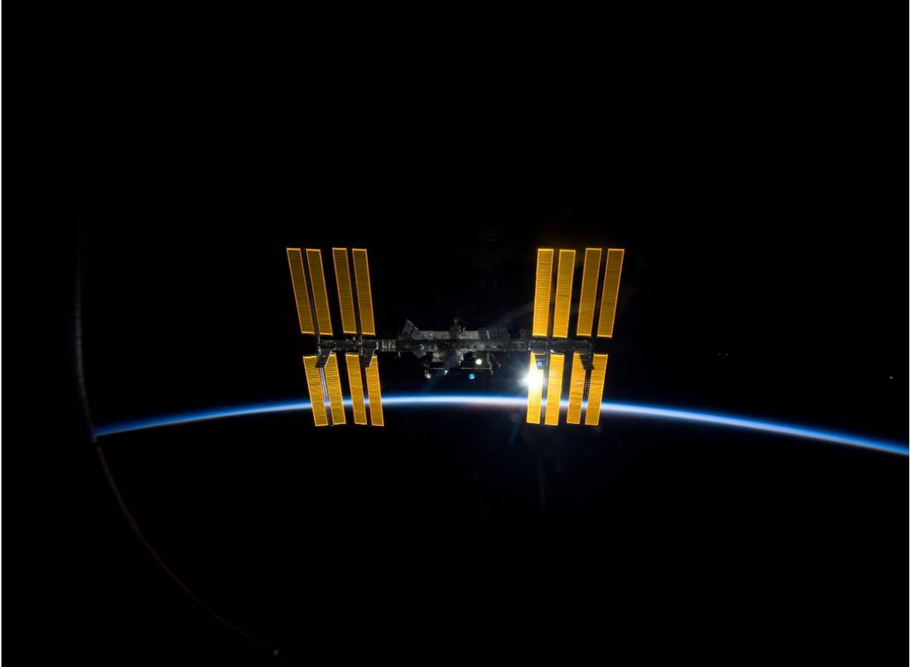
The International space Station in its current configuration as taken from Space Shuttle Discovery following undocking during the STS-119 mission on 25 March 2009.

The name of the long-duration mission to the ISS was chosen by ESA from a total of 520 suggestions received in response to a competition launched by ESA's Directorate of Human Spaceflight in September 2008. These were received from people in all ESA Member States.