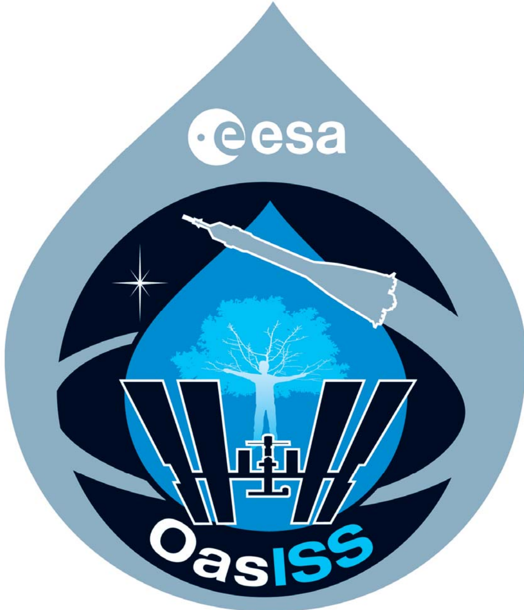
OasISS Mission Logo

In addition to depicting the ISS and Earth as oases for astronauts and humankind, the mission logo features the theme of water as the basis of life as we know it.