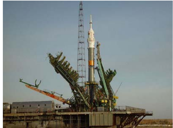
Soyuz launcher on the launch pad at the Baikonur Cosmodrome on 28 October 2002 prior to launch of the Odissea mission with ESA astronaut Frank De Winne and the other crew members of Soyuz TMA-1.

fulfilling the goals of the mission, they will also hold great significance by building on current knowledge and experience for future exploration missions.