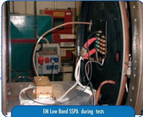
EM Low Band SSPA during tests