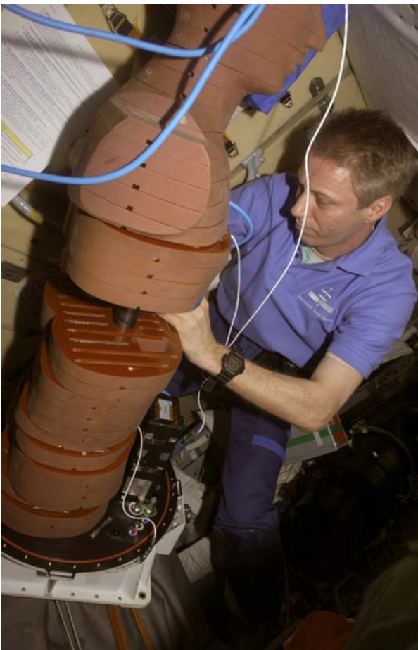
ESA astronaut Thomas Reiter inserting radiation sensors in the European Matroshka experiment in December 2006 in the Zvezda Service Module on the ISS.

system for the Station's robotic arm. During the Mission Perrin carried out three successful spacewalks. On the first two Extravehicular activities, he helped to install the mobile base system and on the third, he performed a late-notice repair of the Station's robotic arm by replacing one of its joints. He spent a total of about 19 hours outside the station. During that mission, he was also arm operator and berthed the MPLM back into the orbiter payload bay towards the end of the mission.