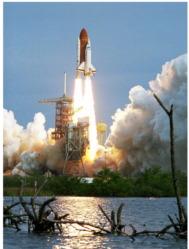
Launch of STS-9 Spacelab-1 mission with ESA astronaut Ulf Merbold on 28 November 1983.

The flight of Nespoli comes in a long tradition of European astronauts who have flown on the Shuttle since ESA astronaut Ulf Merbold from Germany became the first European astronaut to fly on Shuttle in 1983.