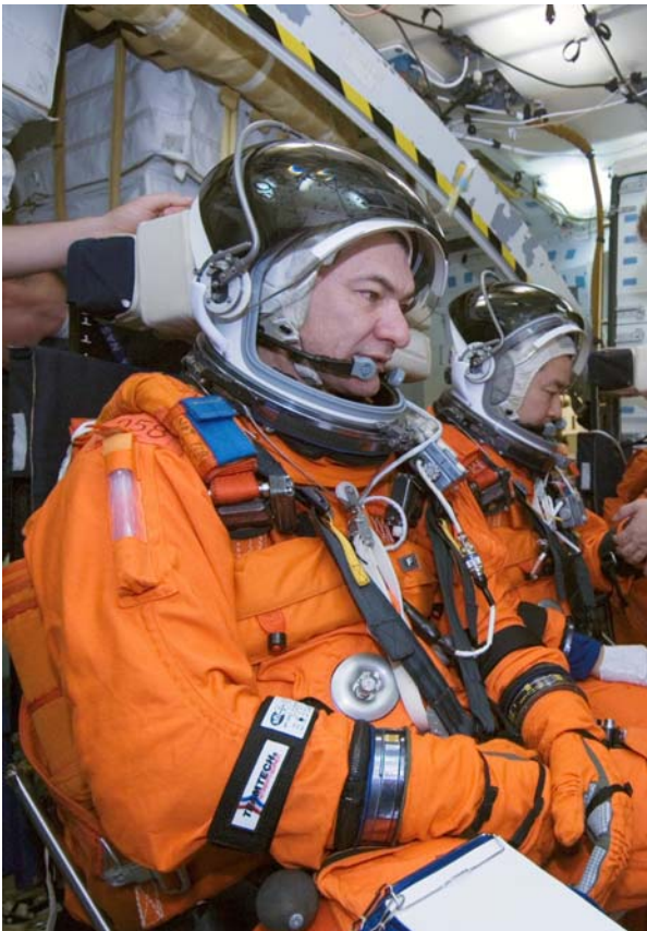
ESA astronaut Paolo Nespoli participating in a post insertion/de-orbit training session at the Johnson Space Center on 9 April 2007.

ESA astronaut Paolo Nespoli from Italy is scheduled to be the next European astronaut launched into orbit onboard the STS-120 Shuttle Discovery mission in October 2007 as a member of the ISS 10A assembly mission. During the mission one of his major tasks will be as intravehicular activity (IVA) astronaut coordinating activities of the spacewalking astronauts during installation of the European-built Node 2 and relocation of the P6 truss section to the end of the port-side truss. Nespoli will also be undertaking a European experiment programme as part of the European Esperia mission.