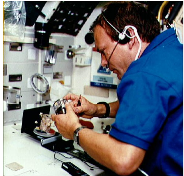
ESA astronaut Hans Schlegel collects fungi samples as part of the Spacelab D-2 mission in 1993.

Messerschmid in 1985. Ulf Merbold undertook his second Spacelab flight in January 1992 (Spacelab IML-1 mission) followed two months later by Belgian astronaut Dirk Frimout. In 1993 DLR astronauts Hans Schlegel (currently an ESA astronaut and scheduled to fly on the STS-122 mission, which will transport the European Columbus laboratory to the ISS in December 2007) and Ulrich Walter, and in November 1994 ESA astronaut Jean-Francois Clervoy. Jean-Jacques Favier (CNES) became the last European astronaut to fly on a Spacelab mission on Shuttle between 20 June and 7 July 1996.