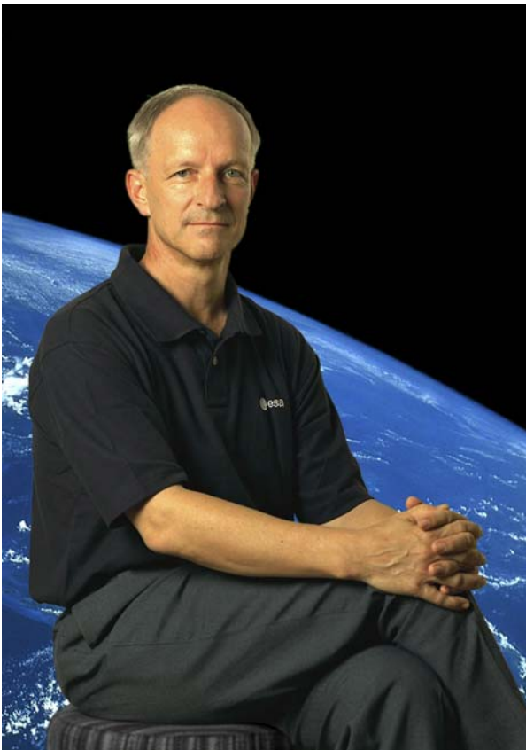
ESA astronaut Claude Nicollier who served on four separate Shuttle missions between 1992 and 1999.

Franco Malerba. This mission deployed the European Retrieval Carrier EURECA and the Tethered Satellite System TSS-1. Nicollier's second mission was on the first Hubble Space telescope servicing mission, STS-61 in December