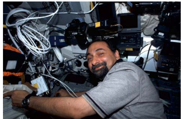
Former ESA astronaut Umberto Guidoni on the flight deck of the Space Shuttle Endeavour during the STS-100 in April 2001.

With the passing of the millennium, Gerhard Thiele became the first European astronaut to fly on Shuttle. From 11-22 February 2000, Thiele participated as mission specialist in the STS-99 Mission. The Shuttle Radar Topography Mission (SRTM) was dedicated to the first, three-dimensional, digital mapping of the Earth surface on a nearly global scale. He was responsible for SRTM operations, including the deployment and retraction of the 200-foot high boom from Endeavour's cargo bay upon which one of the flight's radar systems was mounted. Thiele was also one of two spacewalking crew members, in the event contingency spacewalk would have been required during the flight.