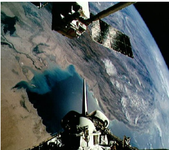
ESA's European Retrieval Carrier (EURECA) being held by the Shuttle's robotic arm prior to deployment on STS-46 Shuttle mission in 1992.

Franco Malerba. This mission deployed the European Retrieval Carrier EURECA and the Tethered Satellite System TSS-1. Nicollier's second mission was on the first Hubble Space telescope servicing mission, STS-61 in December