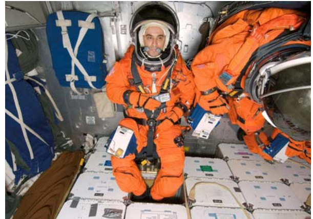
ESA astronaut Léopold Eyharts during STS-122 training at the Johnson Space Center in May 2007.

astronaut Léopold Eyharts who will become a member of the ISS Expedition Crew, taking over from NASA astronaut Dan Tani, who is travelling to the ISS on the STS-120 Discovery flight.