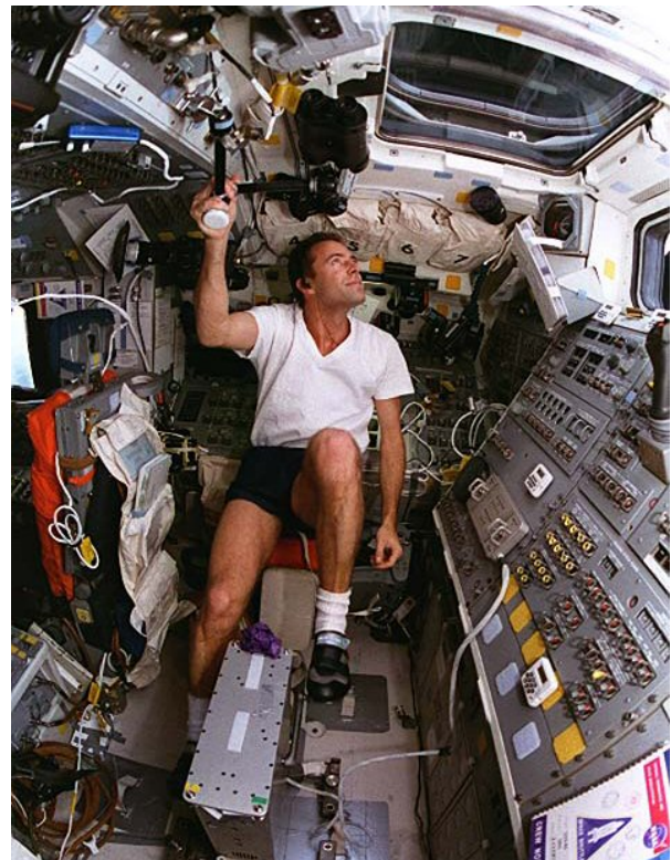
ESA astronaut Jean-Francois Clervoy exercising on the Shuttle flight deck bicycle ergometer on the STS-84 mission, the 6 th Shuttle flight to the Mir Space Station. Clervoy is a veteran of three separate Shuttle missions.

The TSS experiment produced a wealth of new information on the electrodynamics of tethers and plasma physics before the tether broke at 19.7 km, just shy of the 20.7 km goal. Scientists on the ground were able to devise a programme of research making the most of the satellite's free flight while the astronauts' work centered on research related to the USMP-3 Microgravity investigations.