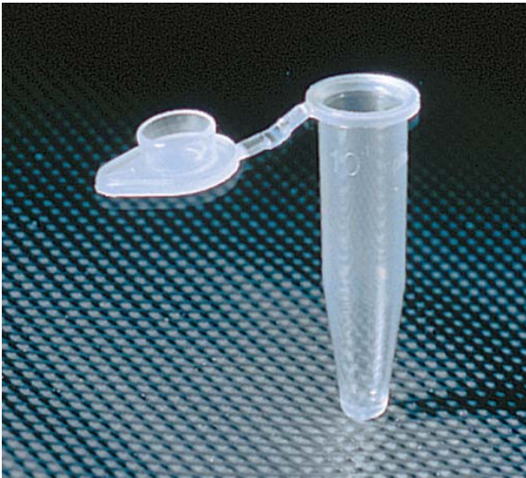
Cuvette used in SPORE experiment.

The SPORE educational experiment goal is the study of PY17 bacterial spores response to exposure to weightlessness and ionizing radiations, both characteristic of the ISS environment. The experiment was conceived by high school students.