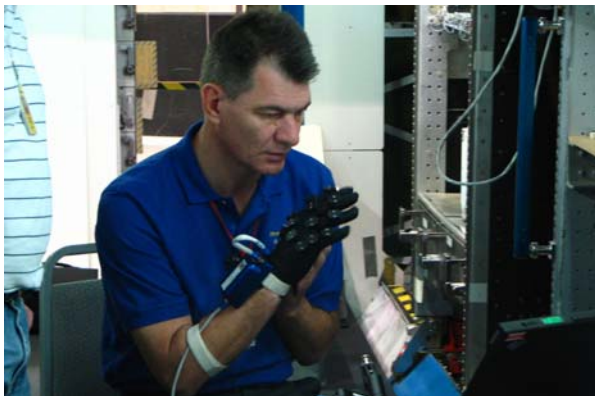
ESA astronaut Paolo Nespoli during Hand Posture Analyser training.

This experiment aims at understanding the ability of the human brain to mentally represent the presence or absence of gravity effects on object motion, and at studying the effects of weightlessness on movement. The Hand Posture Analyser, was launched to the ISS on Progress flight 12P in August 2003, and used during ISS Increments 7 and 8. The preliminary version of the same hardware was used on board the ISS during the "Marco Polo" mission with ESA astronaut Roberto Vittori in 2002. During his second mission in April 2005, astronaut Roberto Vittori performed again the HPA experiment.