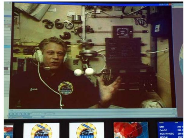
ESA astronaut Thomas Reiter onboard the ISS during a live inflight call with students in the Columbus Control Centre in Oberpfaffenhofen in Germany on 17 October 2006.

ARISS stands for Amateur Radio on the ISS and is an international association of national amateur radio societies of the countries participating in the ISS programme. It forms a valuable part of ESA's Education Programme, helping to stimulate children and young people's interest in science and technical-based subjects and space in general and thereby providing a stimulation for future careers in these areas.