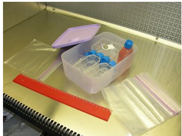
FRTL5 equipment.

This experiment is aimed at assessing the effects of the Space environment (weightlessness and radiation) on normal in vitro cultures of so-called FRTL5 rat thyroid cells. This experiment will use cells already exposed to the space environment during the FRTL-5 experiment on the 10-day Eneide Mission with ESA astronaut Roberto Vittori in April 2005.