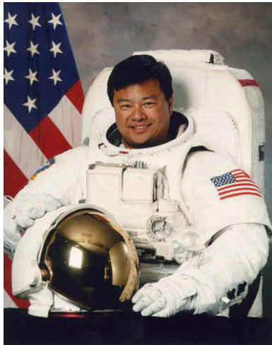
Leroy Chiao (NASA)

Leroy Chiao (NASA) is the ISS Expedition 10 Commander and Salizhan Sharipov (Roscosmos), the ISS Expedition 10 Flight Engineer. They arrived at the ISS on 16 October 2004 in the Soyuz TMA-5 spacecraft with Russian cosmonaut Yuri Shargin who returned with the Expedition 9 Crew 8 days later. The Expedition 10 Crew will return with Roberto Vittori in the Soyuz TMA-5 spacecraft currently docked at the ISS.