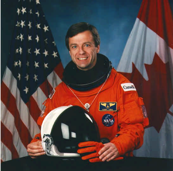
Canadian Space Agency astronaut Robert Thirsk

Personal data: Born 17 August 1953, New Westminster, British Columbia, Canada