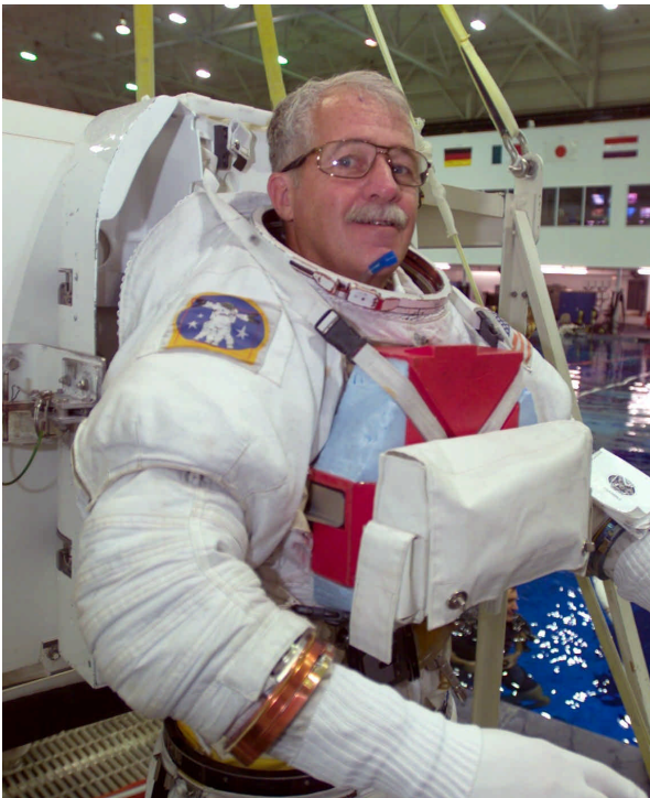
NASA astronaut John Phillips during ISS Expedition 11 training

John Phillips will be the ISS Expedition 11 Flight Engineer, taking over from Russian Roscosmos Cosmonaut Salizhan Sharipov who has been stationed on the ISS since October 2004.