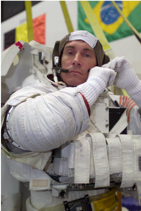
Cosmonaut Sergei Konstantinovich Krikalev during ISS Expedition 11 training

Krikalev will be commander of the Soyuz TMA-6 spacecraft, which will take the Italian Soyuz mission to the ISS and will become ISS Expedition 11 Commander taking over from NASA astronaut Leroy Chiao who has been stationed on the ISS since October 2004.