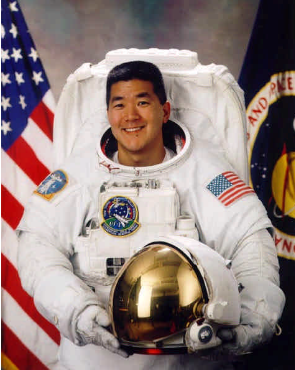
NASA astronaut Daniel Tani is the backup ISS Flight Engineer for Expedition 11