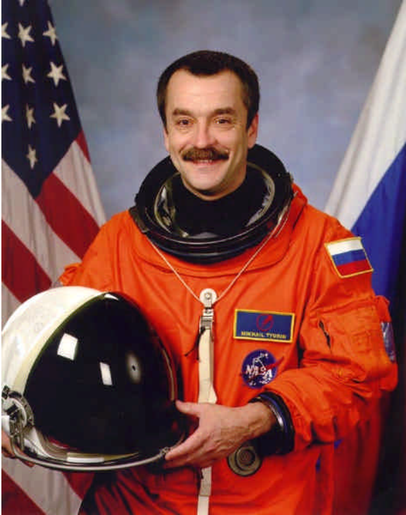
Roscosmos cosmonaut Mikhail Tyurin is the backup ISS Commander for Expedition 11