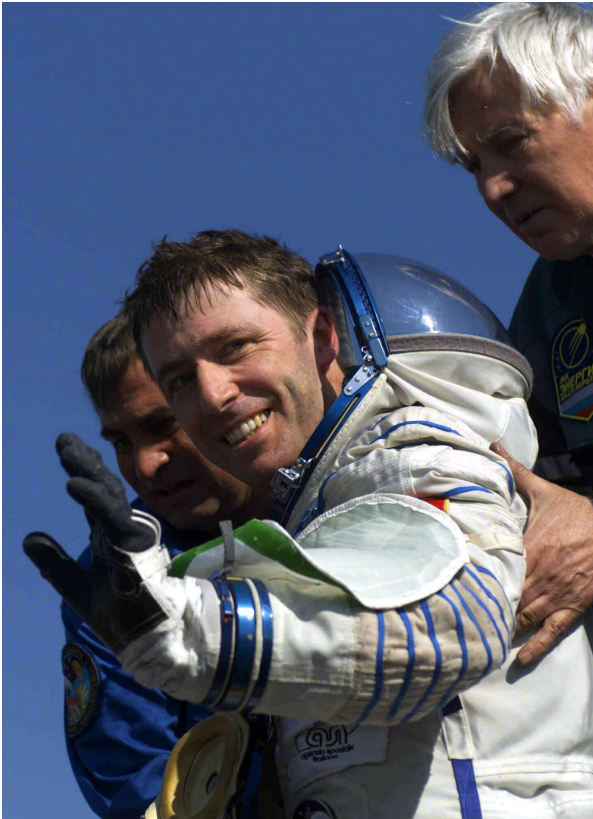
Roberto Vittori after landing of the Marco Polo Mission

national representative in the Beyond Visual Range Air-to-Air Missile (BVRAAM) research and development programme.