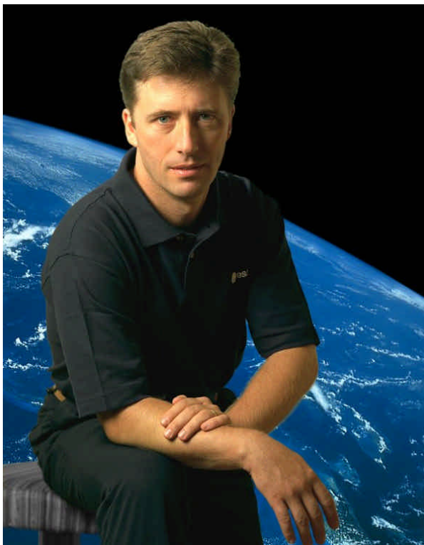
Italian ESA astronaut Roberto Vittori

Roberto Vittori is the primary ESA astronaut for the Italian Soyuz Mission. As part of this mission he will be carrying out a full experimental programme as well as being the Flight Engineer in the Soyuz TMA-6 on the flight to the ISS and in the Soyuz TMA-5 for the return flight. In this role he will be taking an active part in piloting the spacecraft, which will bring him and the other crewmembers to and from the ISS.