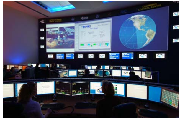
Control Room at the Columbus Control Centre in Oberpfaffenhofen in Germany.

Once it is attached to the ISS, ESA's Columbus Control Centre (Col-CC) in Oberpfaffenhofen in Germany on the premises of DLR's German Space Operations Centre will be responsible for the control and operation of the Columbus laboratory. All the European payloads on Columbus will transfer data, via the ISS data transfer system, directly to the Columbus Control Centre.