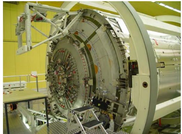
Columbus Laboratory with External Payload Facility attached. August 2004.

These multi-user facilities will have a high degree of autonomy in order to maximise the use of astronauts' time in orbit.