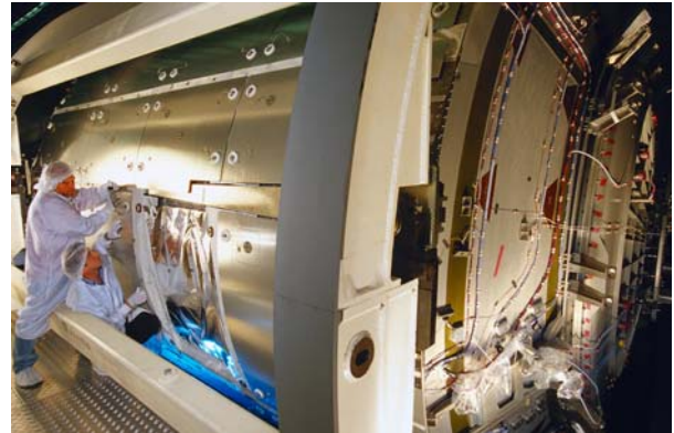
Columbus Laboratory at EADS Astrium in Bremen with debris protection panels. Insulation material exposed under one section of panelling. July 2004.

The Columbus laboratory has a mass of 10.3 tonnes and an internal volume of 75 m 3 , which can accommodate 16 racks arranged around the circumference of the cylindrical section in four sets of four racks. These racks have standard dimensions with standard interfaces, used in all non-Russian modules, and can hold for example experimental facilities or subsystems.