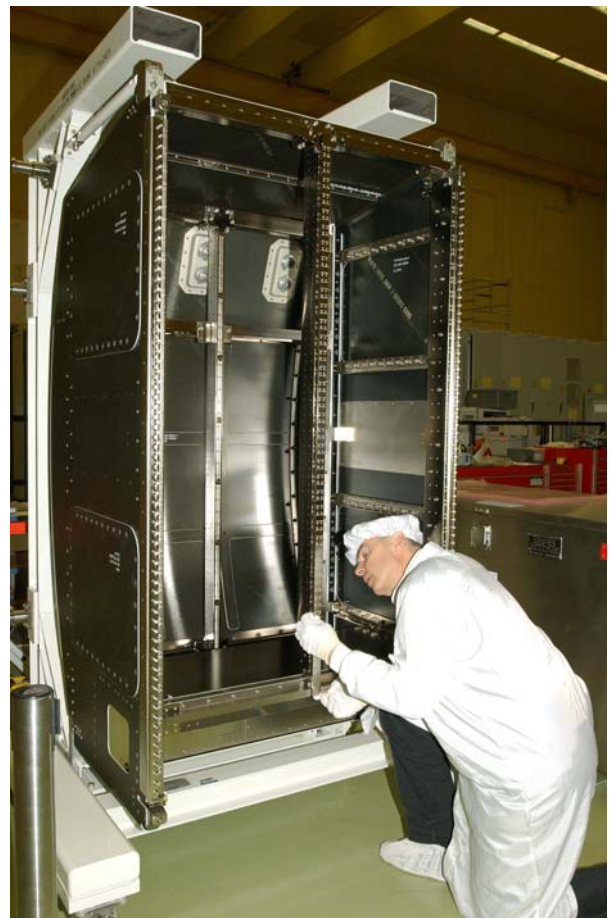
International Standard Payload Rack into which experiment facilities, subsystems or storage racks can be fitted.

Ten of the sixteen are International Standard Payload Racks fully outfitted with resources (such as power, cooling, video and data lines), to be able to accommodate an experiment facility with a mass of up to 700 kg. This extensive experiment capability of the Columbus laboratory has been achieved through a careful and strict optimisation