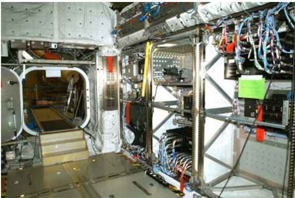
Columbus subsystem racks during testing.

In addition to the accommodation for experiment facilities, three rack positions contain Columbus laboratory subsystems such as water pumps, heat exchanger and avionics, and three racks are for general storage purposes. When fully outfitted the Columbus laboratory will provide a shirt sleeve environment of 25 m 3 in which up to three astronauts can work. The laboratory will receive a supply of up to 20 kW of electricity of which 13.5 kW can be used for experimental facilities.