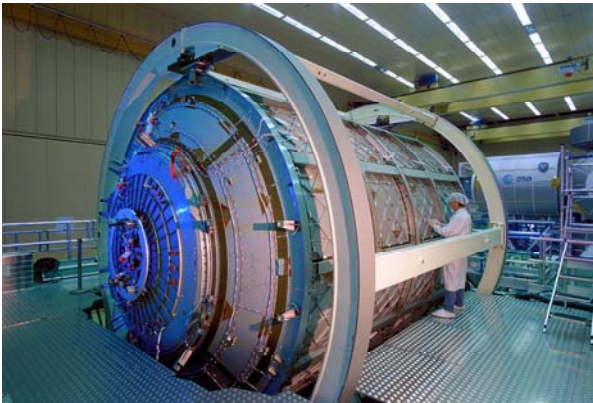
Columbus Laboratory in integration hall of EADS in Bremen. Primary structure exposed. June 2002.

of the system configuration, making use of the end cones for housing subsystem equipment. The central area of the starboard cone carries system equipment such as video monitors and cameras, switching panels, audio terminals and fire extinguishers.