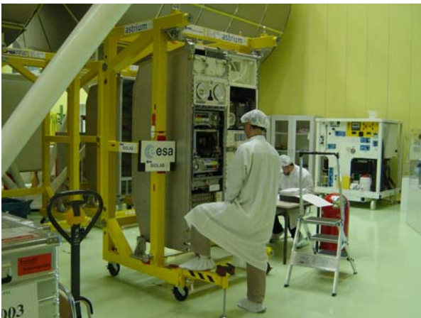
Biolab Experiment facility during payload integration. May 2004.

Although it is the Station's smallest laboratory module, the Columbus Laboratory offers the same payload volume, power, and data retrieval, for example, as the Station's other laboratories, but on a smaller and cheaper scale. A significant benefit of this cost-saving design is that Columbus will be launched already outfitted with 2500 kg of experiment facilities and additional hardware. This includes the ESA-developed experiment facilities: