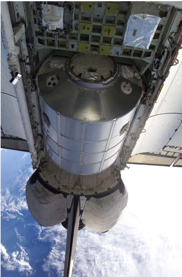
Multi-purpose Logistics Module 'Leonardo' in the Space Shuttle cargo bay on 10 March 2001 during STS-102 mission to the ISS. The Columbus Laboratory shares its basic structure with the Multi-Purpose Logistics Modules.

and maintain high reliability, the laboratory shares its basic structure and life-support systems with the European-built Multi-Purpose Logistics Modules (MPLMs): pressurised cargo containers, which travel in the Space Shuttle's cargo bay.