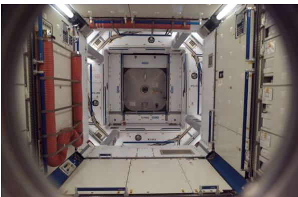
The interior of the European-built Node 2, photographed on 27 October 2007 after it was attached to its temporary location on the International Space Station during STS-120 flight day five activities.

For the internal environment, Columbus is ventilated by a continuous airflow sucked in from Node 2, the European-built ISS module where the Columbus Laboratory will be permanently attached. The air returns to Node 2 for refreshing and carbon dioxide removal. This air content is monitored by Columbus subsystems for contamination.