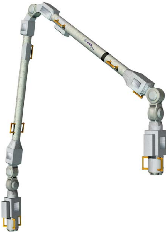
The European Robotic Arm (ERA).

modules of the ISS. The Nodes are used to control and distribute resources between the connected elements. The ISS will have three Nodes. Node 1, called Unity, was developed by NASA. It became the second module of the ISS in orbit after its launch in December 1998. Node 2 and 3 are developed under an ESA contract with European industry with Alenia Spazio as the prime contractor.