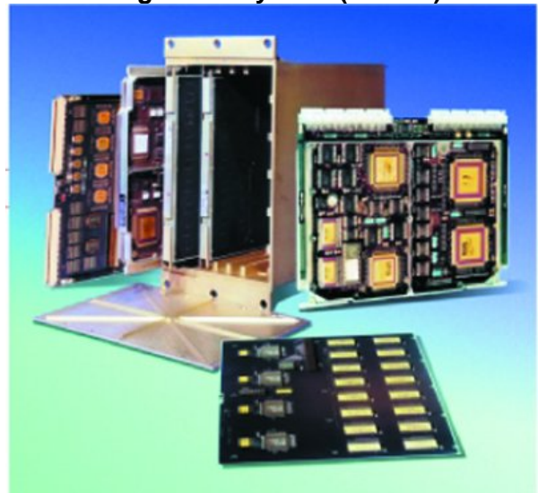
The European-built Data management System.

Europe's DMS-R Data Management System was the first piece of European hardware on the ISS in July 2000. It includes two fault-tolerant computers and two control posts. It is the 'brain' or control centre of the Russian Segment of the ISS and carries out a great degree of the vital and fundamental functions on the station including: guidance, navigation and control of the entire ISS; failure management and recovery; and control of additional ISS systems and subsystems.