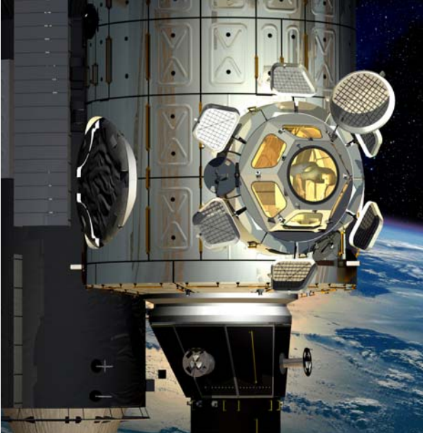
Artist's impression. Cupola observation Module attached to Node 3.

The Cupola will become a panoramic control tower for the International Space Station, a dome-shaped module with windows through which operations on the outside of the Station can be observed and guided. It is a pressurised observation and work area that will accommodate command and control workstations and other hardware.