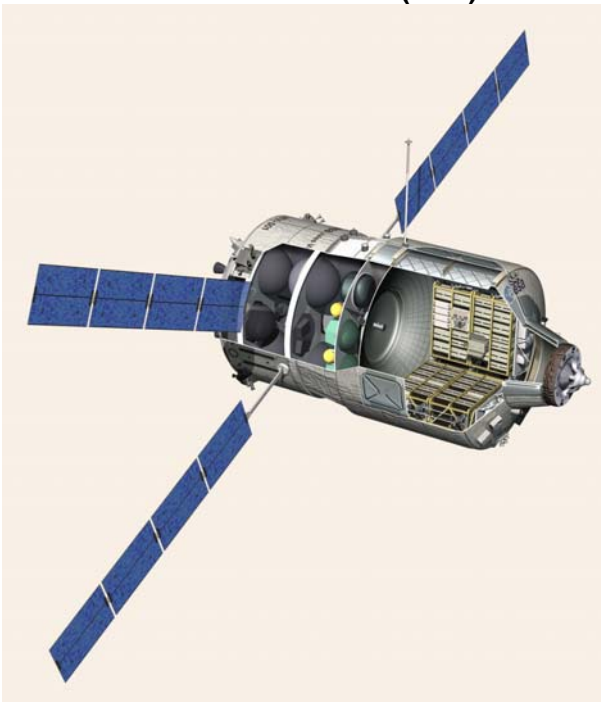
The Automated Transfer Vehicle.

The Automated Transfer Vehicle is Europe's unmanned supply vehicle for the ISS. It will take up to 9 tonnes of cargo to the ISS, boost the station to a higher orbiting altitude and remove up to 6.5 tonnes of waste from the station. It measures approximately 10 metres long by 4.5 metres in diameter, with solar arrays spanning more than 22 metres for generating its electrical power. Cargo transported will include pressurised cargo, water, air, nitrogen, oxygen and attitude control propellant. The first planned launch is in the middle of 2007.