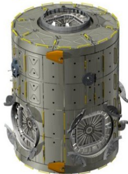
ESA-developed Node 2 (top), the attachment point of the Columbus Laboratory and Node 3 (bottom). Node 3 will be the attachment point of the Cupola.

Nodes are pressurised modules that interconnect the research, habitation, control and docking