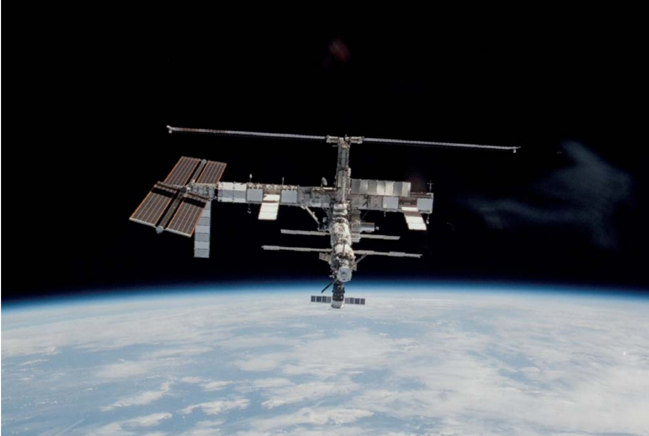
International Space Station photographed from the Space Shuttle Atlantis on 17 September 2006

The International Space Station is a co-operative programme between United States, Russia, Canada, Japan and ten Member States of the European Space Agency (Belgium, Denmark, France, Germany, Italy, The Netherlands, Norway, Spain, Sweden and Switzerland).