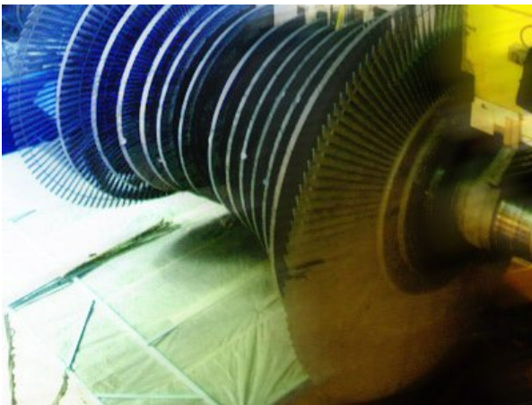
Research within the ELIPS programme could make significant developments in turbine blade production for use in, for example, the aerospace industry.

In Material Sciences, the space environment is used to measure thermo-physical properties of metals and alloys with unprecedented accuracy. These properties are being used by industry in numerical models to optimise their production processes and even develop new materials with advanced properties. With European Union funding, a large 5-year research project is carried out within the ELIPS programme for the development of more efficient aircraft engines and hydrogen fuel cells.