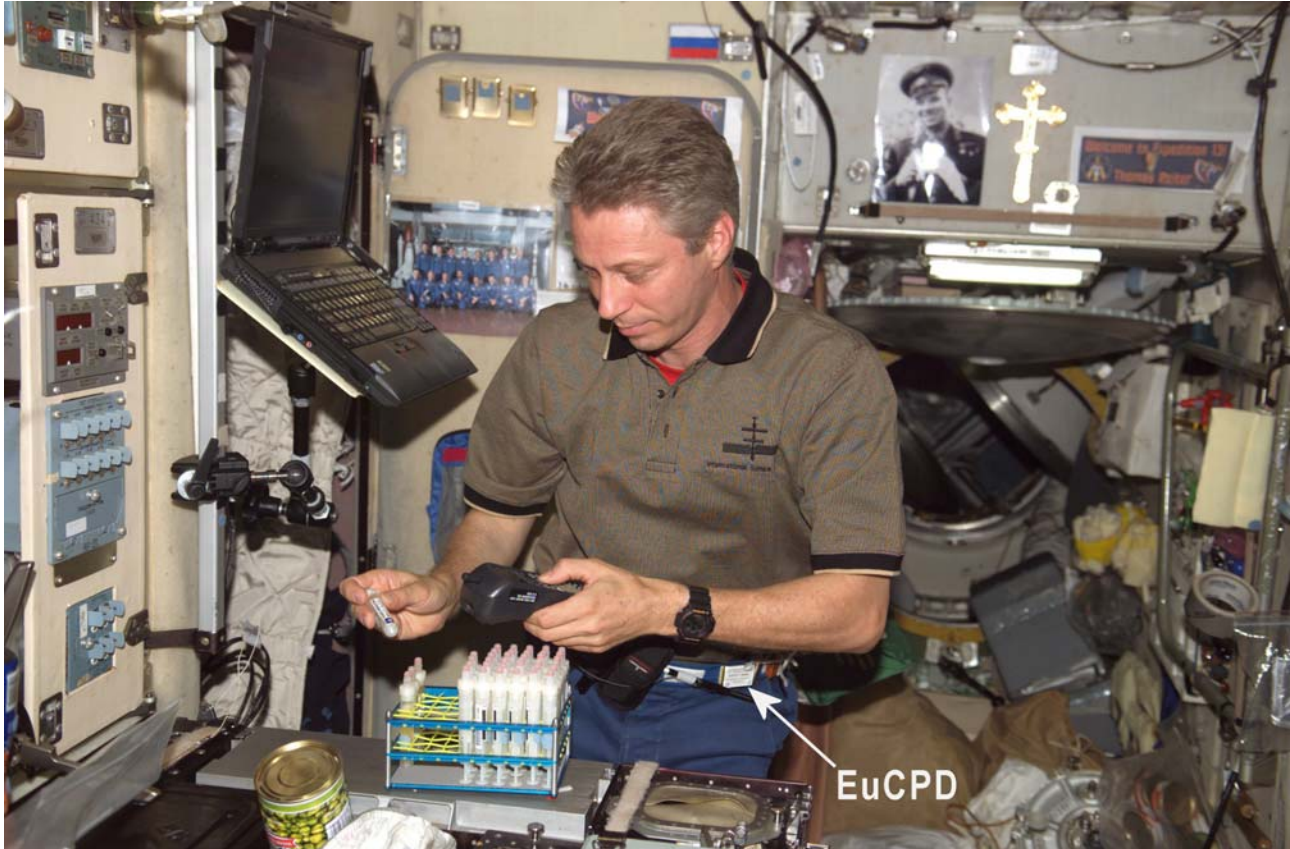
ESA astronaut Thomas Reiter wearing European Crew Personal Dosimeter during sample processing on the ISS.

ESA astronaut Christer Fuglesang from Sweden will be equipped with passive personal radiation dosimeters to measure the radiation exposure during his flight. ESA astronaut Thomas Reiter has been using similar dosimeters since arriving at the ISS in July 2006.