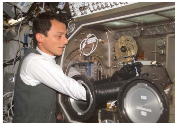
Pedro Duque during experiment operations in the MSG during the Cervantes mission. 20 October 2003.

PFS (Pulmonary Function System) and the MSG (Microgravity Science Glovebox). These facilities are very essential for the execution of ESA's ISS utilisation programme. Some of them will even be transferred from Destiny to the Columbus laboratory once it is deployed on orbit.