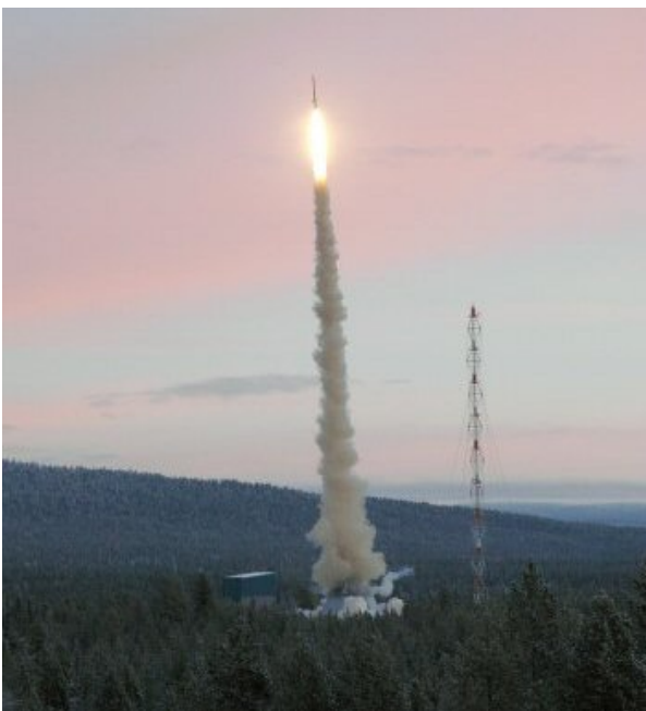
Launch of Texas 42 sounding rocket on 1 December 2005 from the Esrange launch site near Kiruna in northern Sweden.

In Fundamental Physics, novel states of matter such as complex plasma's and solid/liquid dust particles, cold atoms and Bose-Einstein condensates are examined within the ELIPS programme. Careful study of these systems requires weightlessness, since on Earth they are too much influenced by gravitational effects. These studies are very fundamental in nature and will lead to new theories on physical processes. However, practical examples such as very stable atomic clocks that can be used in future navigation systems are also envisaged.