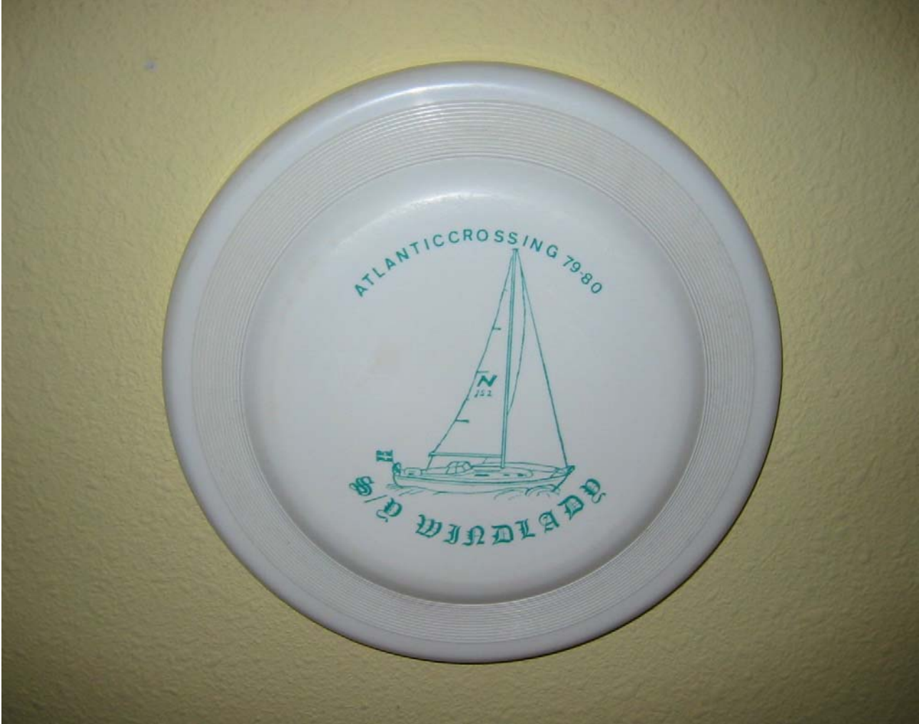
The frisbee that Fuglesang will be taking into space.

A little known fact about Christer Fuglesang is that he was once a Swedish national frisbee champion, holding the national title in ' maximum time aloft ' in 1978 i.e. the longest time a frisbee can stay in the air. Hereafter he competed in the Frisbee World Championship in 1981.