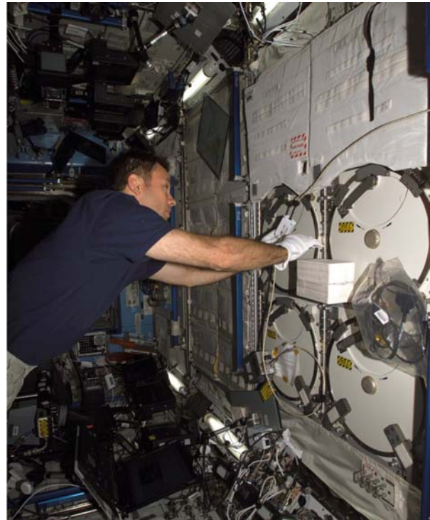
Expedition 14 commander Michael Lopez-Alegria working with MELFI in the ISS Destiny laboratory on 3 October 2006

Destiny laboratory, like the EMCS (European Modular Cultivation System), MELFI (Minus Eighty Degrees Laboratory Freezer for the ISS), PEMS (Percutaneous Electrical Muscle Stimulator),