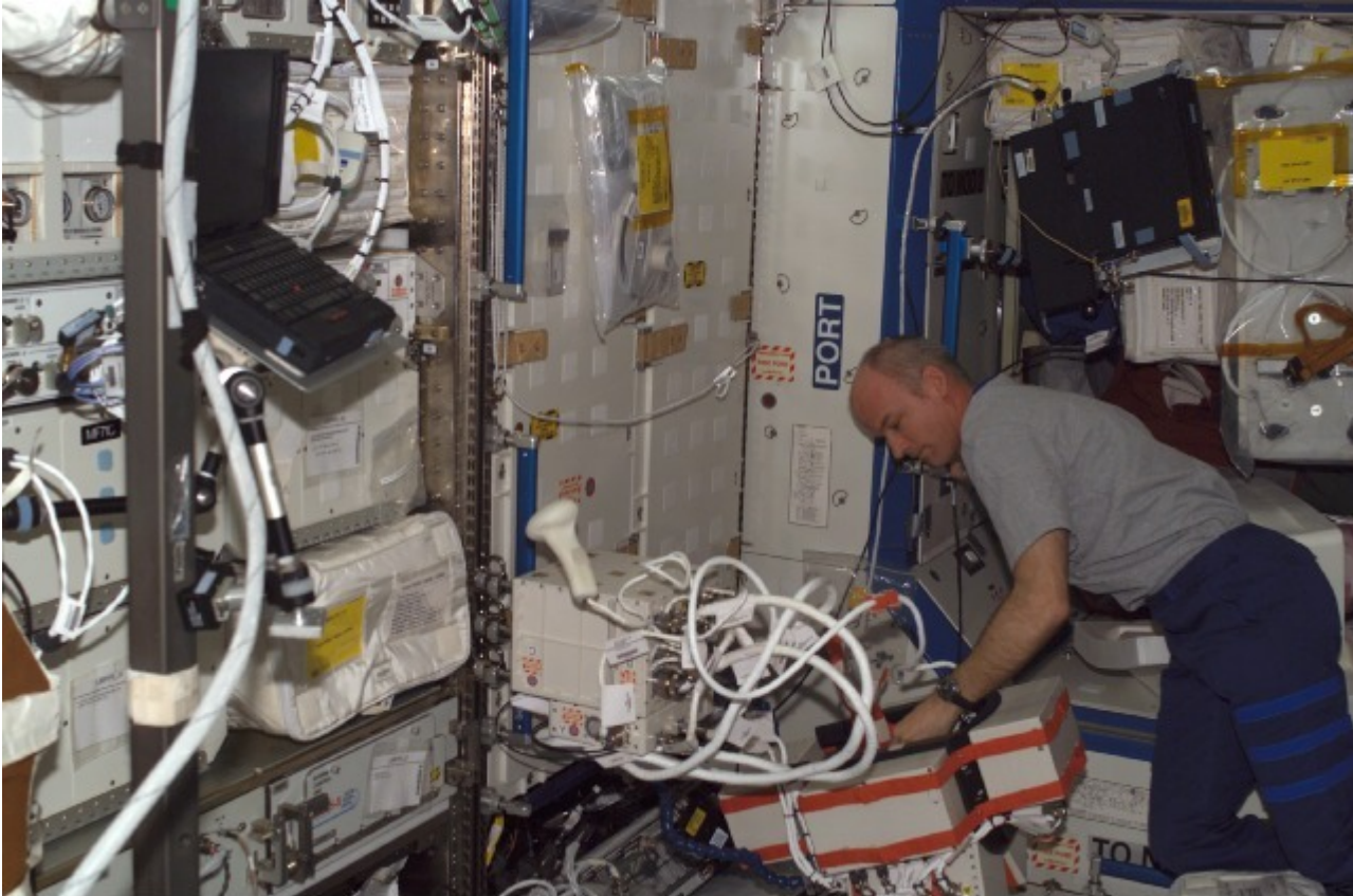
NASA astronaut Jeff Williams next to the ALTEA hardware in the U.S. Laboratory of the ISS during Expedition 13.

This activity involves the filming of a mini documentary about the ALTEA experiment to form part of a lesson on radiation for 16-18 year olds. While ESA astronaut Christer Fuglesang is undertaking the ALTEA experiment on the ISS as part of the Celsius mission, ESA astronaut Thomas Reiter, currently on the ISS as an Expedition 14 flight engineer will film the experiment.