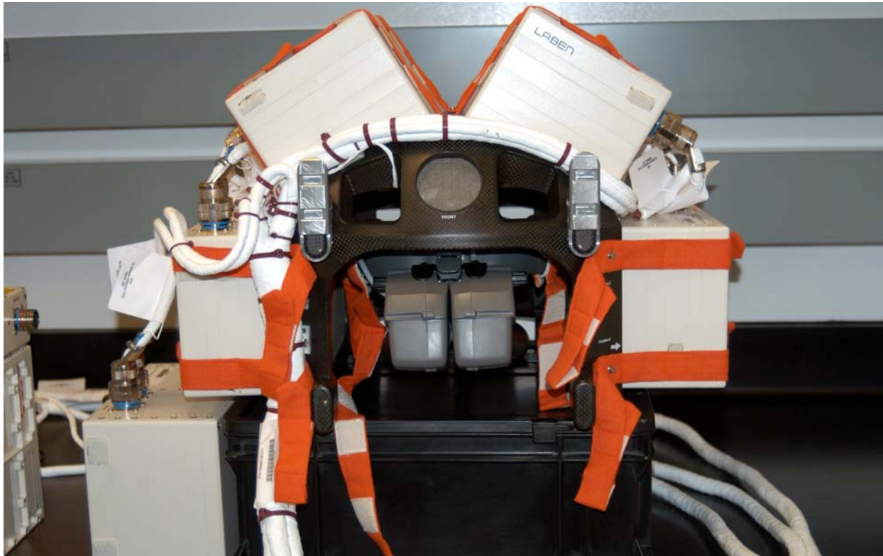
ALTEA Flight Hardware.

The ALTEA project investigates the effects of cosmic radiation on brain function. The focus of the programme will be on abnormal visual perceptions (often reported as "light flashes" by astronauts) and the impact that particle radiation has on the retina and visual structures of the brain under weightless conditions. ALTEA will also provide more information on the radiation environment in the ISS.