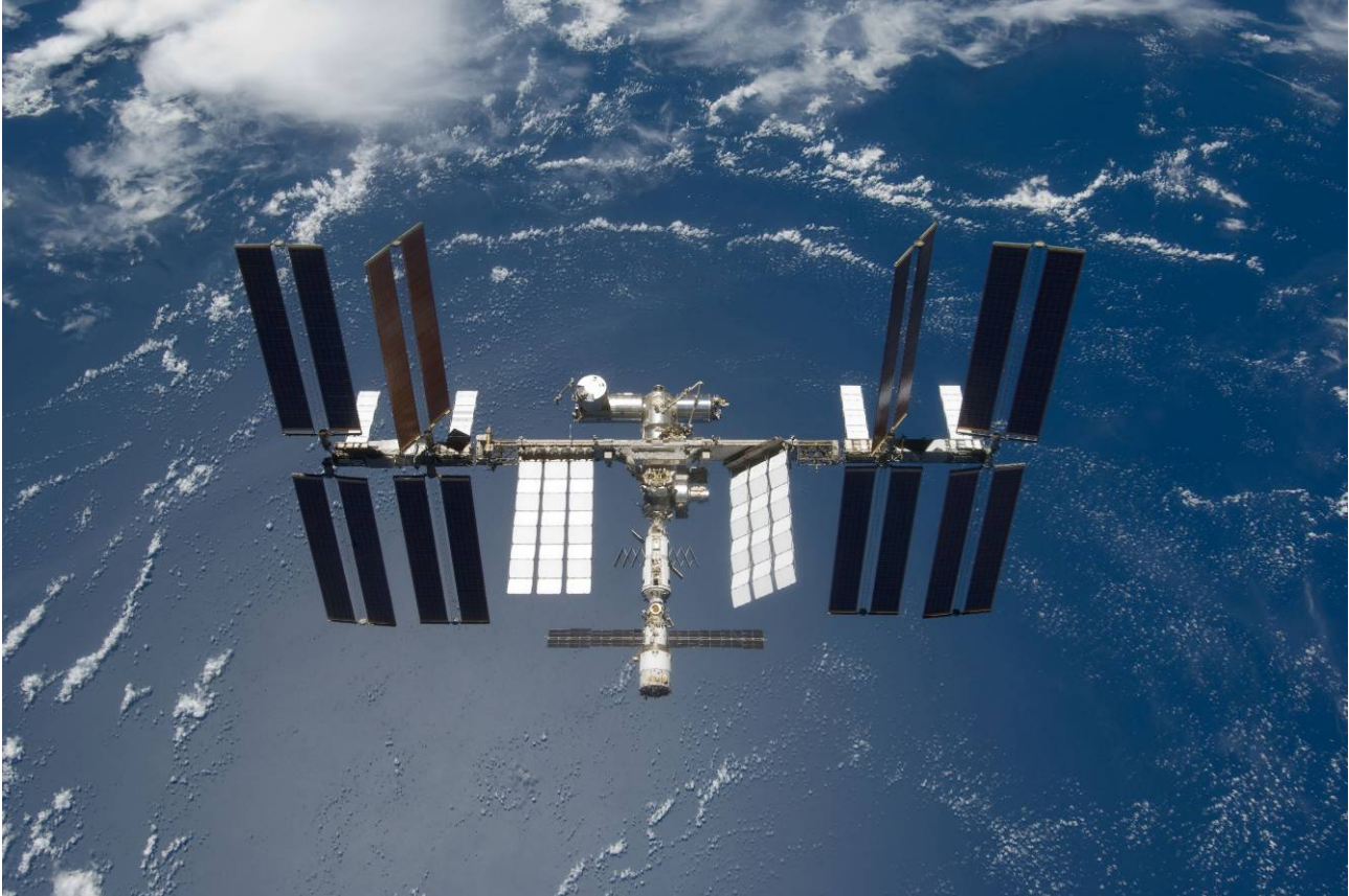
The International Space Station photographed from Shuttle Discovery following undocking during the STS-119 mission on 25 March 2009

The International Space Station is a co-operative programme between United States, Russia, Canada, Japan and ten Member States of the European Space Agency (Belgium, Denmark, France, Germany, Italy, The Netherlands, Norway, Spain, Sweden and Switzerland).