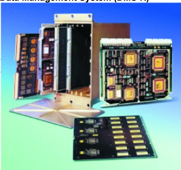
The European-built Data management System.

Europe's DMS-R Data Management System was the first piece of European hardware on the ISS in July 2000. It includes three fault-tolerant computers and two control posts. It is the 'brain' or control centre of the Russian Segment of the ISS and carries out a great degree of the vital and fundamental functions on the station including: guidance, navigation and control of the entire ISS; failure management and recovery; and control of additional ISS systems and subsystems.