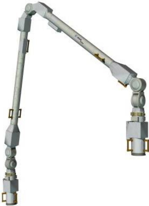
The European Robotic Arm (ERA).

has an extensive range, as it is able to walk around the Russian segment of the station and while in orbit is able to manipulate up to 8000 kg of mass. ERA is scheduled to arrive at the ISS in 2011.