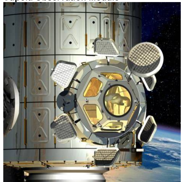
Artist's impression. Cupola observation Module attached to Node 3.

The Cupola will become a panoramic control post for the International Space Station (ISS), a dome-shaped module with windows through which operations on the outside of the Station can be observed and guided. It is a pressurised observation and work area that will accommodate command and control workstations and other hardware.