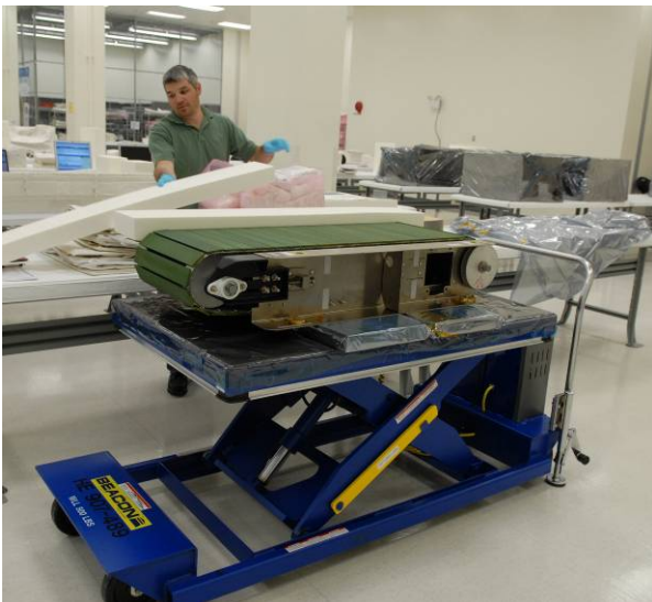
COLBERT treadmill being prepared prior to installation in a Multi-Purpose Logistics Module.

COLBERT is a new treadmill, which will go into the European-built Node 2 (and later Node 3) to act as an important exercise device for the ISS Crew. It is adapted from a regular treadmill but designed so as not to shake the rest of the Station. This vibration damping system does not use power and hence makes it more reliable. The astronauts use elastic straps over the shoulders and round the waist to keep them in contact with the running belt. The treadmill is also wider than the one currently on the Station. Although it is built to handle 240,000 km of running, it will likely see about 60,000 km during its time in orbit.