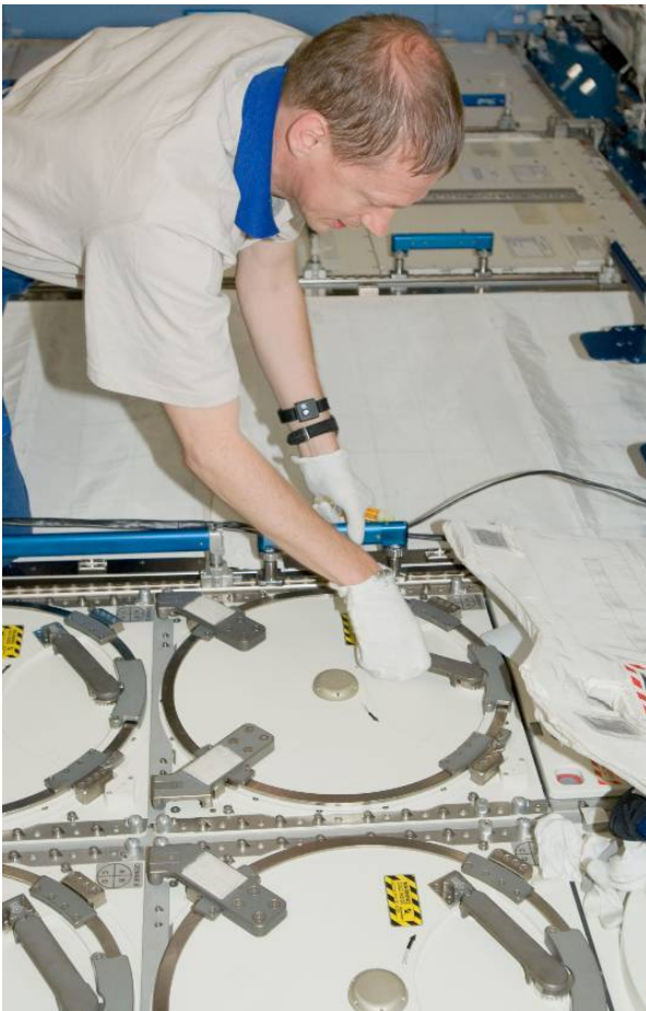
ESA astronaut Frank De Winne preparing to put samples in MELFI in the Japanese Kibo Laboratory on the ISS on 6 June 2009.

The second flight unit of the Minus Eighty (Degrees) Laboratory Freezer for the ISS (MELFI) will be flying to the ISS on the STS-128 flight. It is a rack-size facility which provides the Space Station with refrigerated volume for storage and fast freezing of life science and biological samples. It will fly in passive mode in the Multi-Purpose Logistic Module (MPLM) installed in the Shuttle's cargo bay. MELFI was designed for an operational lifetime of 10 years, but thanks to additional spares and sophisticated maintenance operations defined by European Industry will remain permanently on orbit during the life of the ISS.