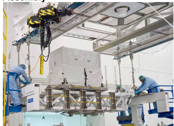
Ammonia Tank Assembly attached to the support structure that will be transported in Discovery's cargo bay for the STS-128 flight. Photo taken at the Kennedy Space Center on 9 July 2009

The Ammonia Tank Assembly is principally a tank containing the liquid ammonia used for thermal regulation on the ISS. It will be transported to the ISS on a support structure placed in the Shuttle's cargo bay along with the MPLM.