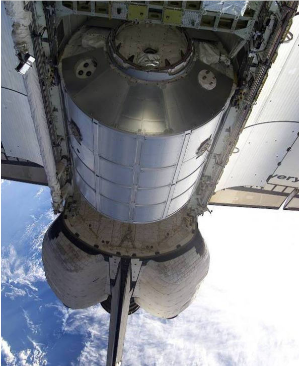
The Leonardo Multi-Purpose Logistics Module in the cargo bay of Space Shuttle Discovery on 10 March 2001

The MPLMs are pressurised cargo containers that travel in the Space Shuttle's cargo bay. Three of these modules were built for the Italian Space Agency (ASI) by Thales Alenia Space in Turin. These modules, named Leonardo, Raffaello and Donatello, are key elements in International Space Station resupply. Leonardo first visited the station on the STS-102 mission in March 2001 and has been used on four missions since then (STS-105, STS-111, STS-121 and STS-126). Raffaello docked to the ISS first in April 2001 on the STS-100 mission, which brought ESA astronaut Umberto Guidoni as the first ESA astronaut to visit the ISS, and has been used twice since (STS-108 and STS-114).