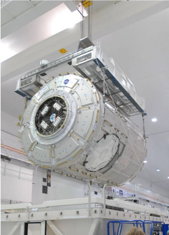
A crane lifts the European-built Node 3 from its shipping container on 26 May 2009

The Atmospheric Revitalization System is one of the Environmental control and Life Support Systems that will be located in the European-built Node 3 when it arrives at the ISS in February 2010. It provides carbon dioxide removal, trace contaminant control, and gas constituent analysis. Crew-generated carbon dioxide is removed from the cabin atmosphere by sorbent beds that are designed to absorb carbon dioxide. The beds are regenerated upon exposure to heat and space vacuum. A Trace Contaminant Control System ensures that over 200 various trace chemical contaminants generated from material off-gassing and crew metabolic functions in the habitable volume remain within allowable and safe concentration limits. Gas is analysed by a mass spectrometer, measuring oxygen, nitrogen, hydrogen, carbon dioxide, methane and water vapour present in the cabin.