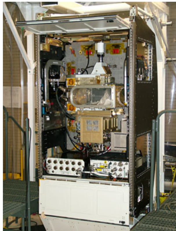
The Fluids Integrated Rack shown with the door open with the first experiment inside

This facility will carry out experiments with fluids, in the US Destiny laboratory. It makes up half of the Fluids and Combustion Facility, which deals with the challenges of working with fluids and combustion processes in weightlessness. The Fluids Integrated Rack provides data acquisition and control, sensor interfaces, laser and white light sources, advanced imaging capabilities, power, cooling, and other resources. It can accommodate a wide range of experiments. The focus of the fluid physics research is on complex fluids, interfacial phenomena, dynamics and instabilities, multiphase flows, and phase changes. Investigations range from fundamental research to technology development in support of the NASA Exploration missions. These include areas of life support, power, propulsion, and thermal control systems.