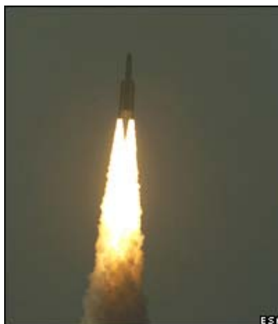
The Ariane 5 would have the power to launch an upgraded mission

A Geophysics/Environment Package (GEP) would also be sent with the rover. This fixed station, once placed on the planet's surface, could sense "Marsquakes" and monitor weather.