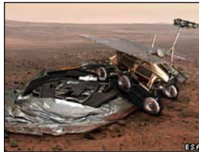
The robotic rover mission is set to be launched in 2013

Talks to resolve the design of Europe's rover mission to Mars are converging on a "best solution for science", a senior space official has told the BBC.