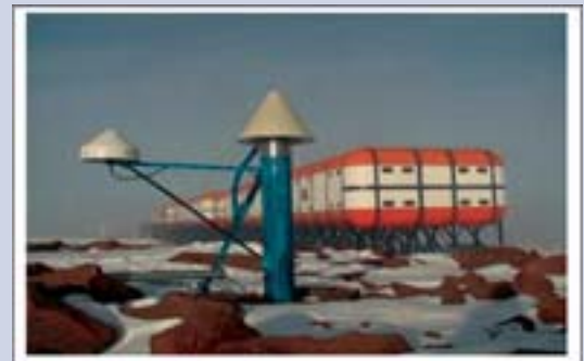
GSTB Sensor Station in Vesleskarvet (Antarctica)