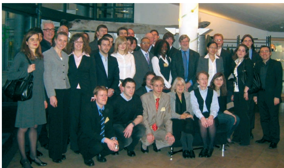
Teams, Judges and Timekeepers

The students solved a hypothetical dispute entitled: “Case concerning the continued provision of lifeline satellite services to countries in the face of satellite operator insolvency, Concordia and Landia v Usurbia ” which sought “to explore the extent to which international law considerations,