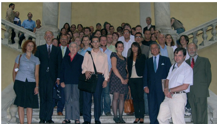
Participants of the ECSL Summer Course