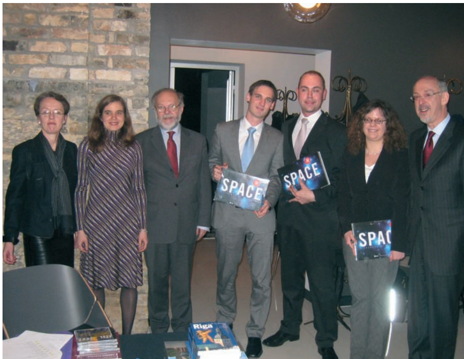
University of Augsburg, Germany, the winning team

the International Institute of Space Law Moot Court 2008 brochure).