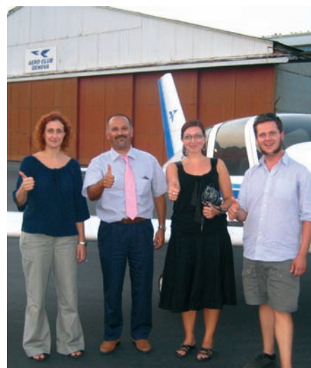
Some volunteers for the dusk flight above Portofino

They also appreciated the various activities proposed to them, by the University of Genoa, during the week-end (free access to the Aquarium, to the museums and to the Palazzo Ducale Tower of Genoa) and during the week (dusk flight above Portofino for the volunteers, visit of the Piaggio Aero Industries, one of the world's leading aerospace companies, lunch at Pallazzo Tursi, Gala dinner at the city hall). Thus, the Summer Course enabled the students through groups' activities to enrich their knowledge in the area of Space Law and Policy. We hope they will come across other opportunities to improve and enlarge their expertise in the field. The Summer