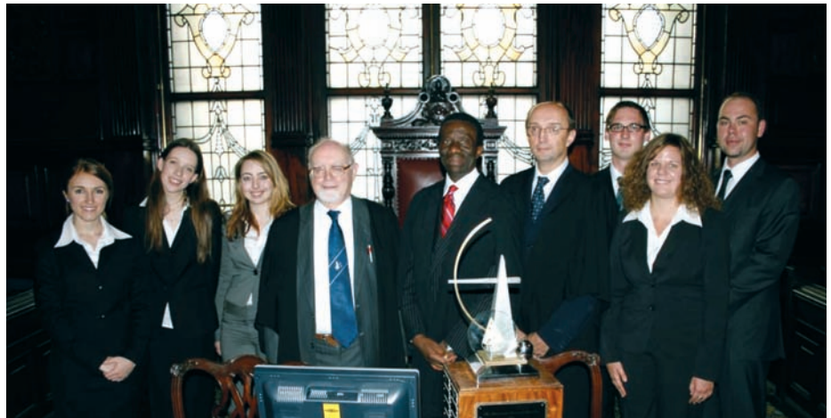
City Chambers, Glasgow, Moot Court World Final